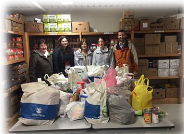
Food Drive (November 2014)