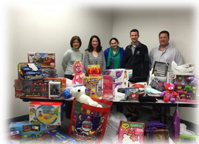
Toy Drive (December 2014)